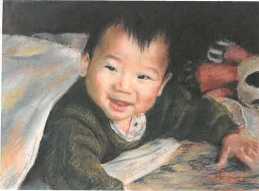
A painting by Xiaojie Zheng of a child